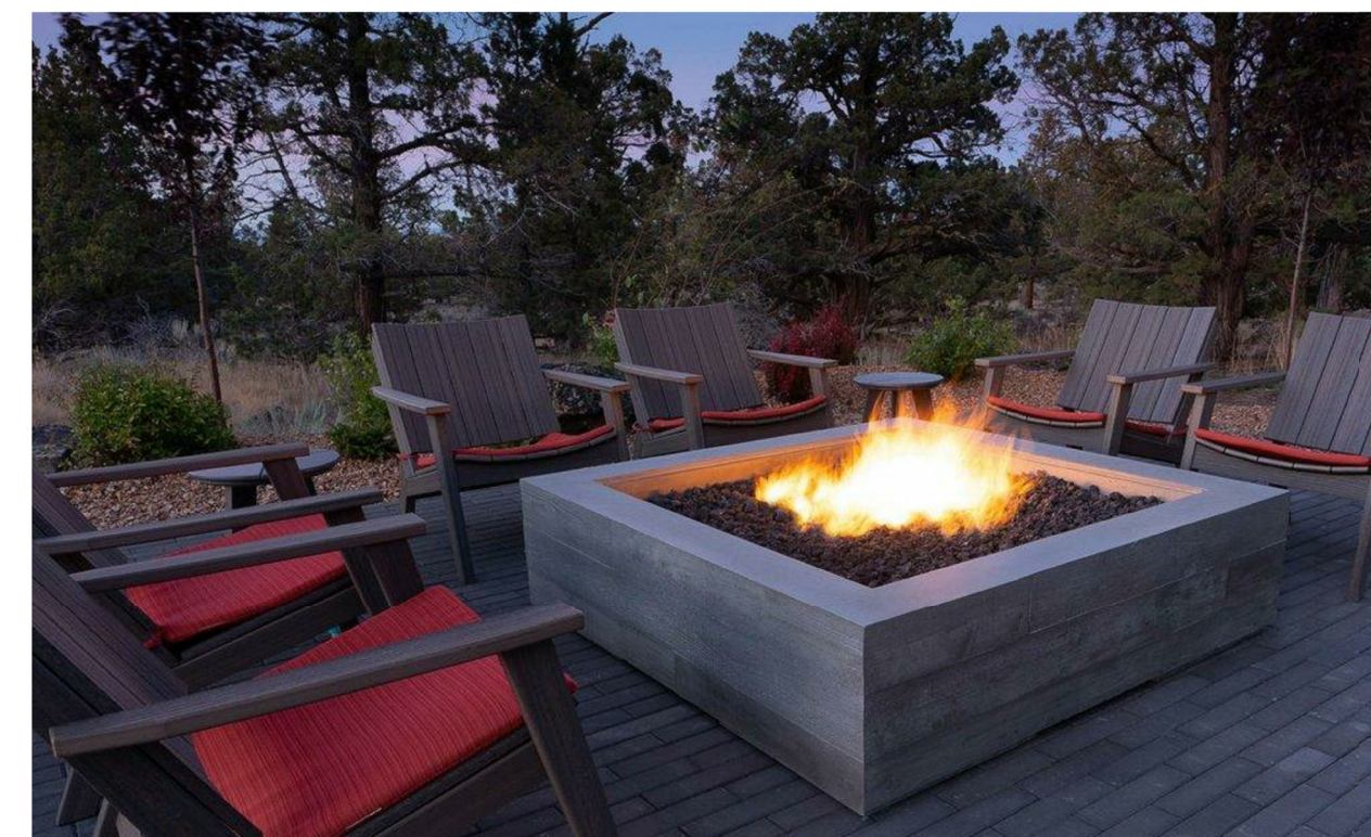
COMMUNITY FIRE PIT