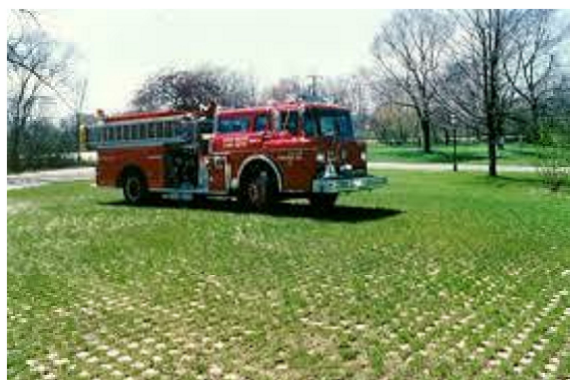
GRASSCRETE FIRETRUCK ACCESS