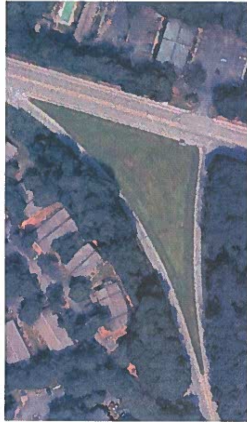
Memorial Drive and Covington Drive Intersection 35,045 sf