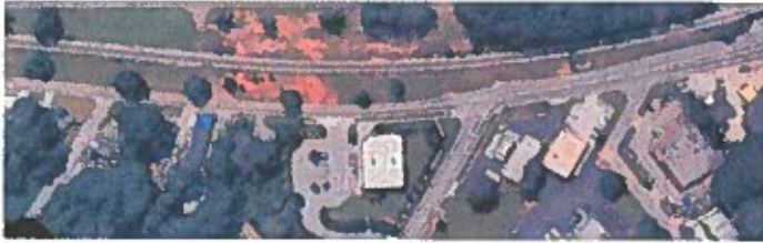
Ponce de Leon and North Decatur Intersection-45,400 sf