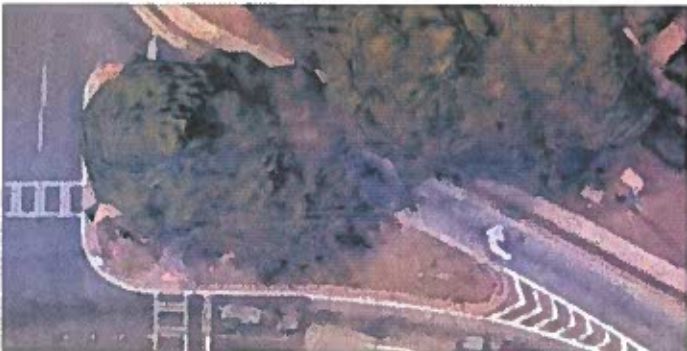
North Druid Hills and Clairmont Road Intersection-2,635 sf