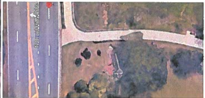
North Druid Hills and Spring Creek Road Intersection-1,295 sf