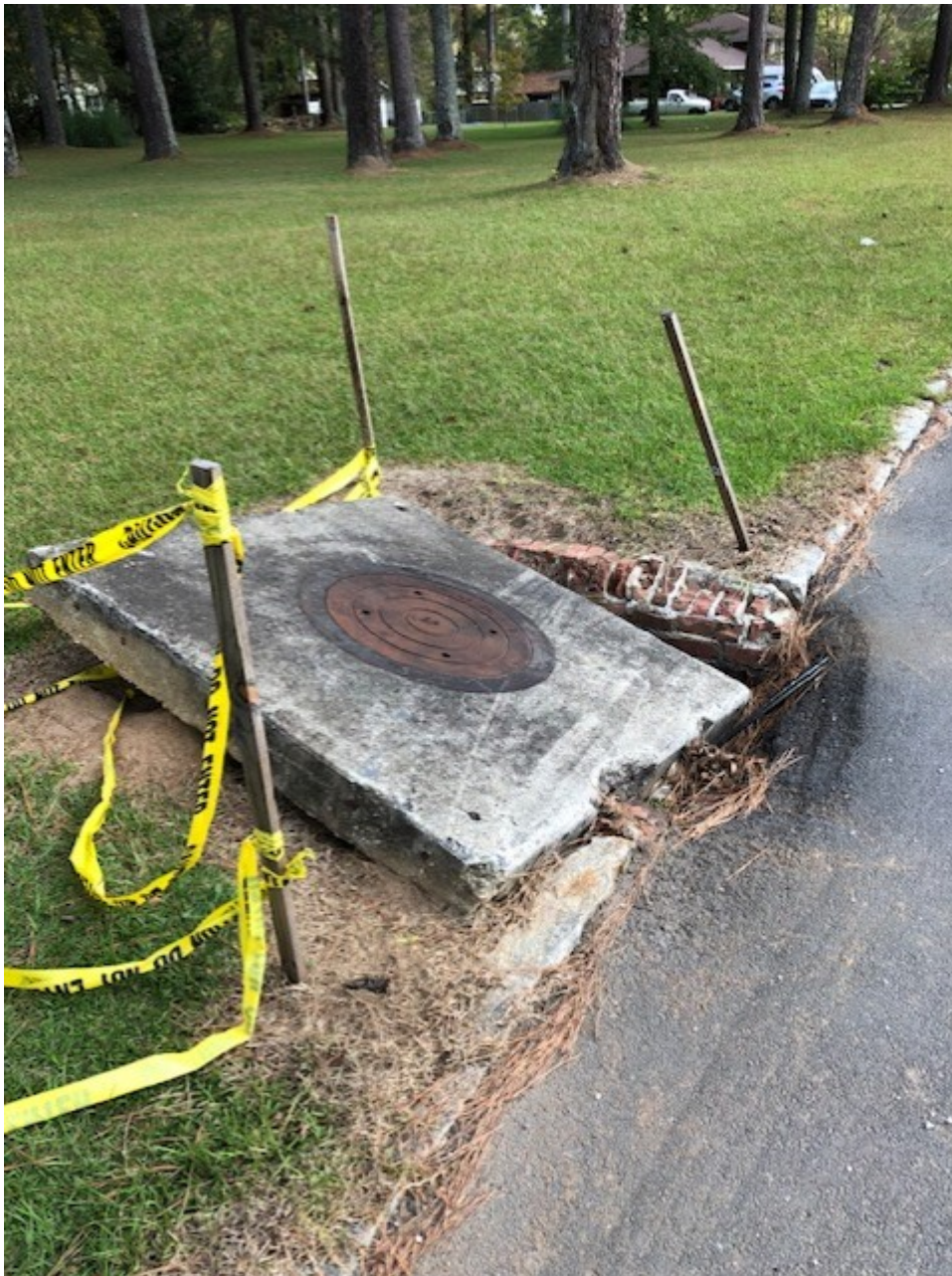
This culvert on Cedar Grove at the end on East Conley was run over by a truck. It has been repaired multiple times but has been in this condition for a few months now.