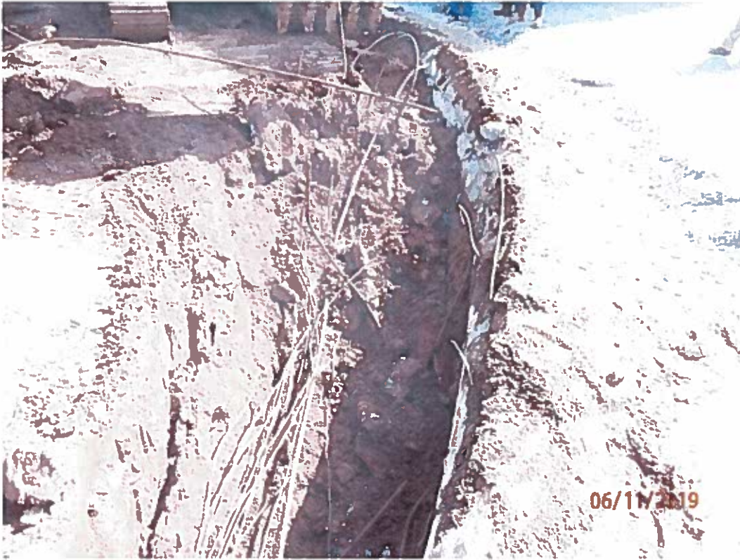
Unforeseen Conditions - Paving Excavation at Dewatering Bldg