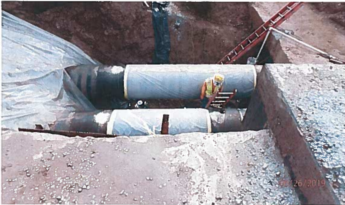
Removal of Asbestos on 42-inch RWW Line