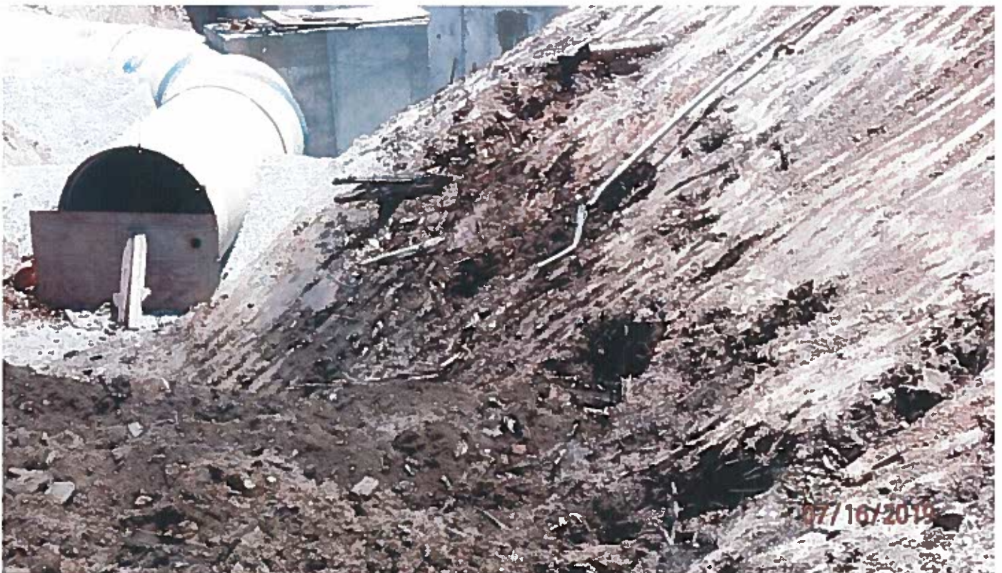
Excavation of Unsuitable Soil at 78-inch MFE (Membrane Filter Effluent) Line