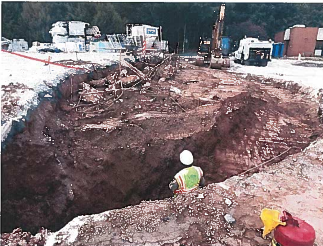
Removal of Unforeseen Abandoned Digester Structure at Dewatering Bldg