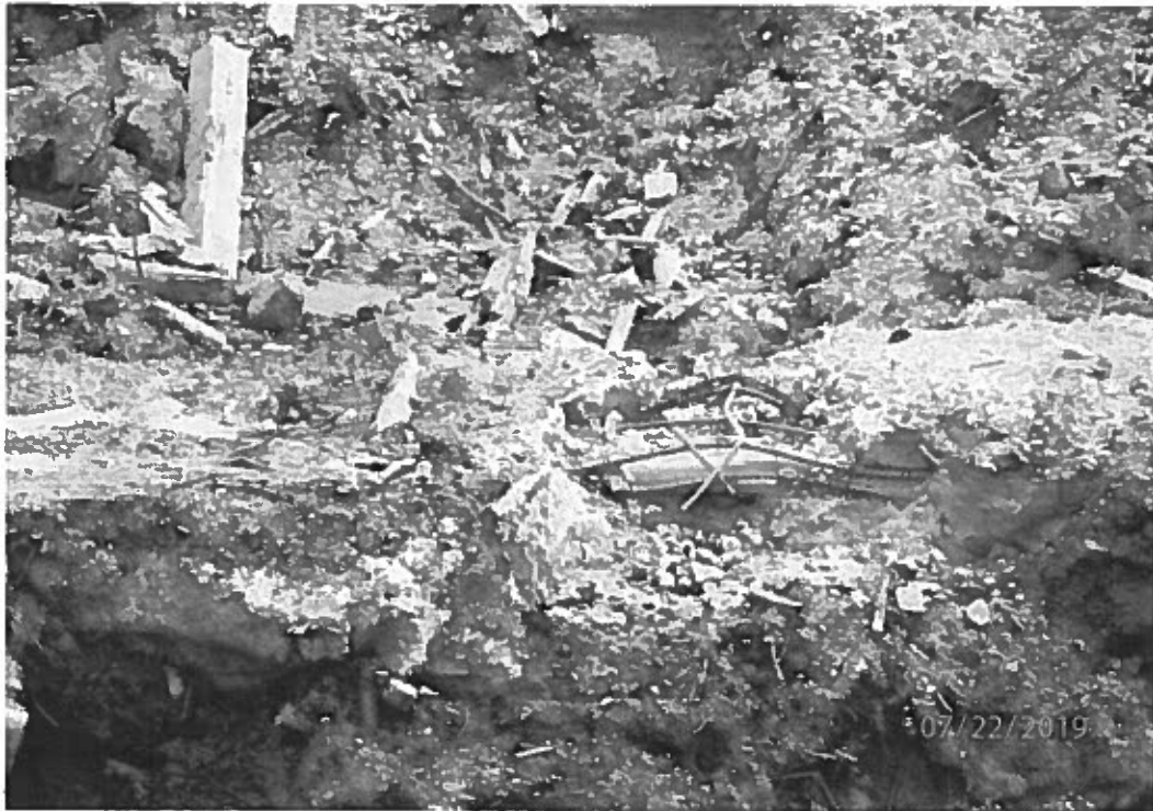
Unforeseen Conditions – Duct Bank at Chlorine Building