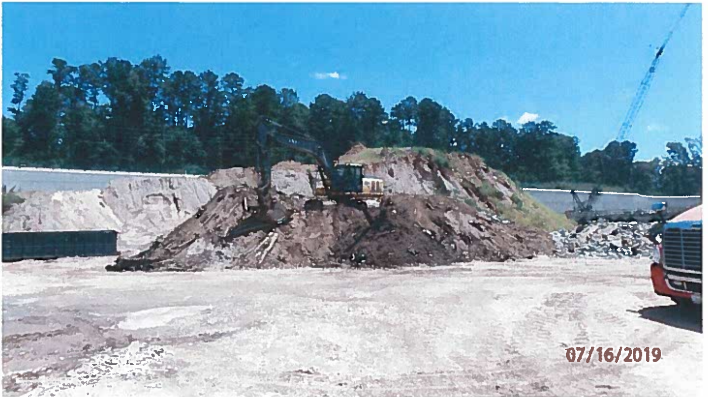
Stockpile of Unsuitable Soil from 78-inch MFE (Membrane Filter Effluent) Line