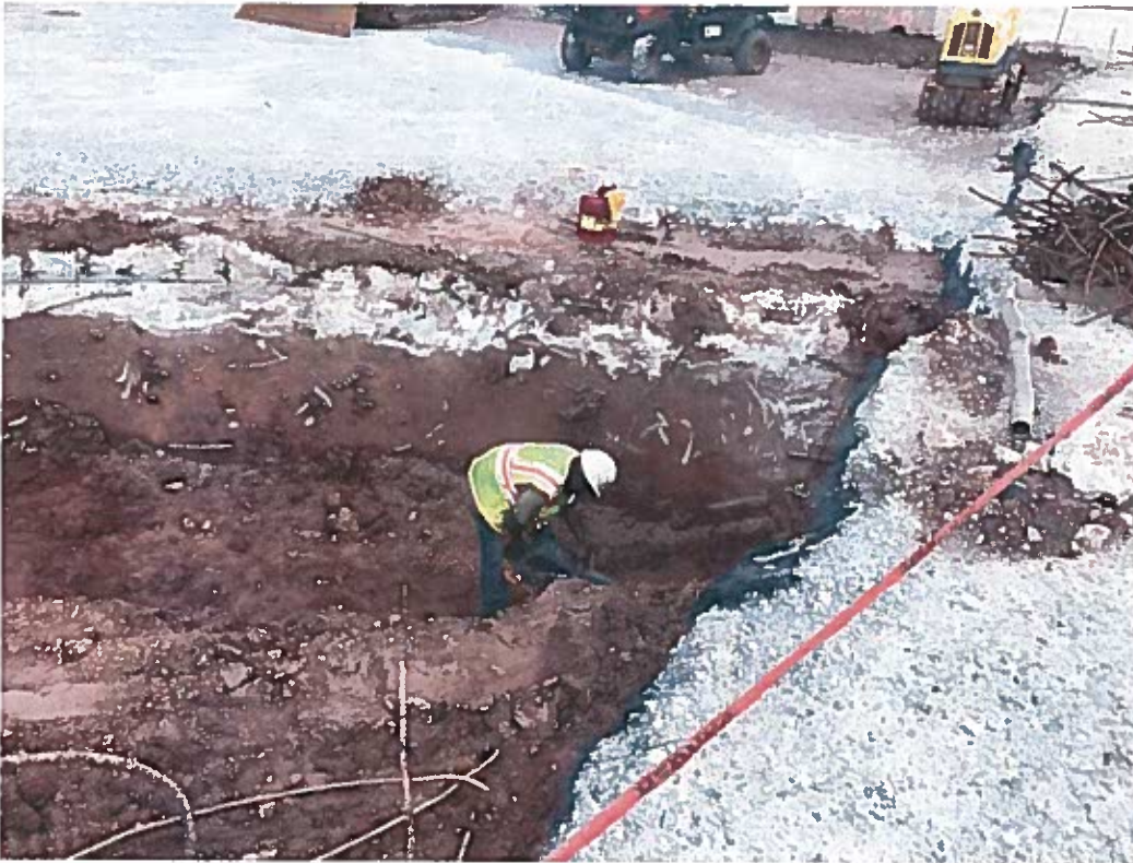
Removal of Unforeseen Abandoned Digester Structure at Dewatering Bldg