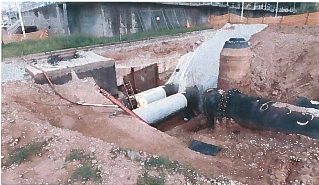
Removal of Asbestos on 42-inch RWW Line