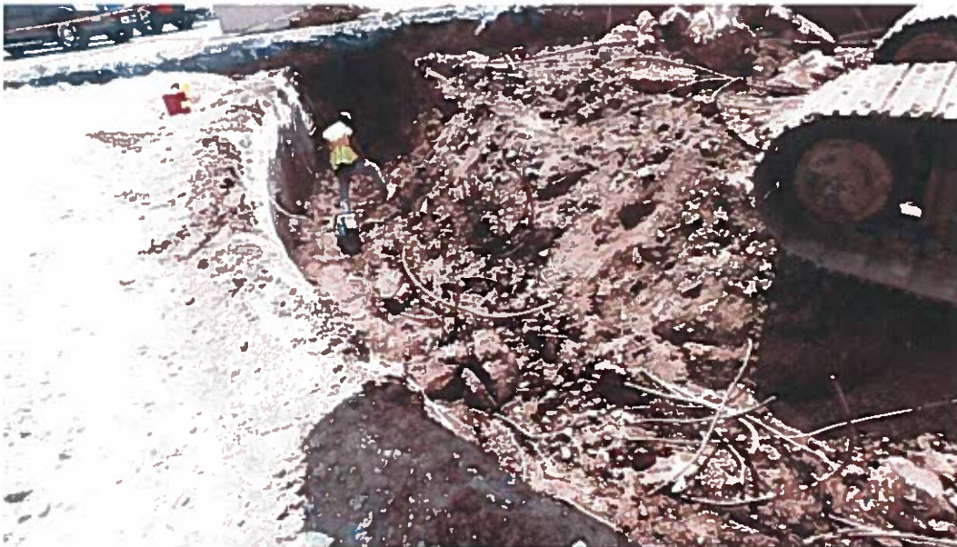
Unforeseen Conditions - Paving Excavation at Dewatering Bldg