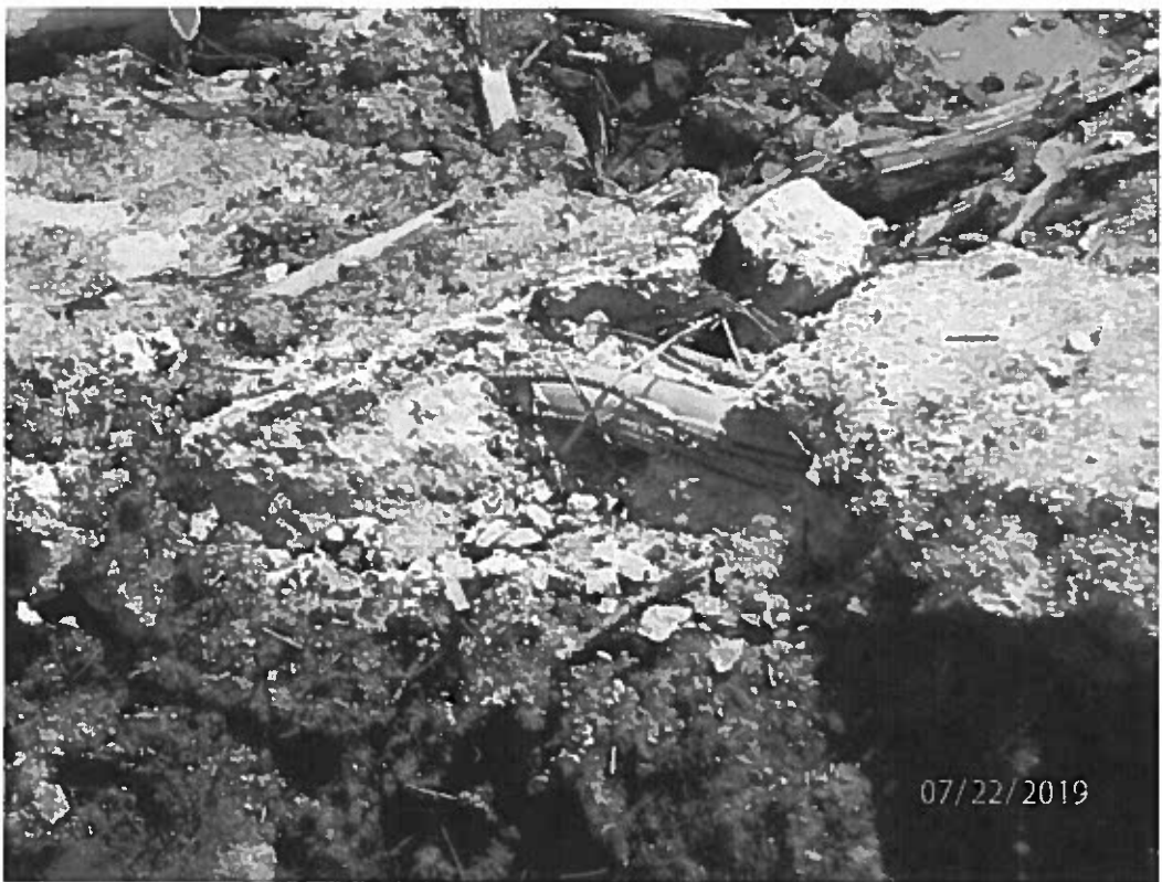
Unforeseen Conditions – Duct Bank at Chlorine Building