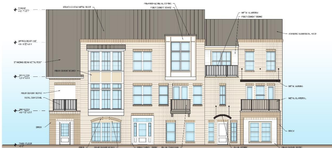
A TOWNHOME FRONT ELEVATION A - 2 CAR SCALE: 3/16" = 1'-0"