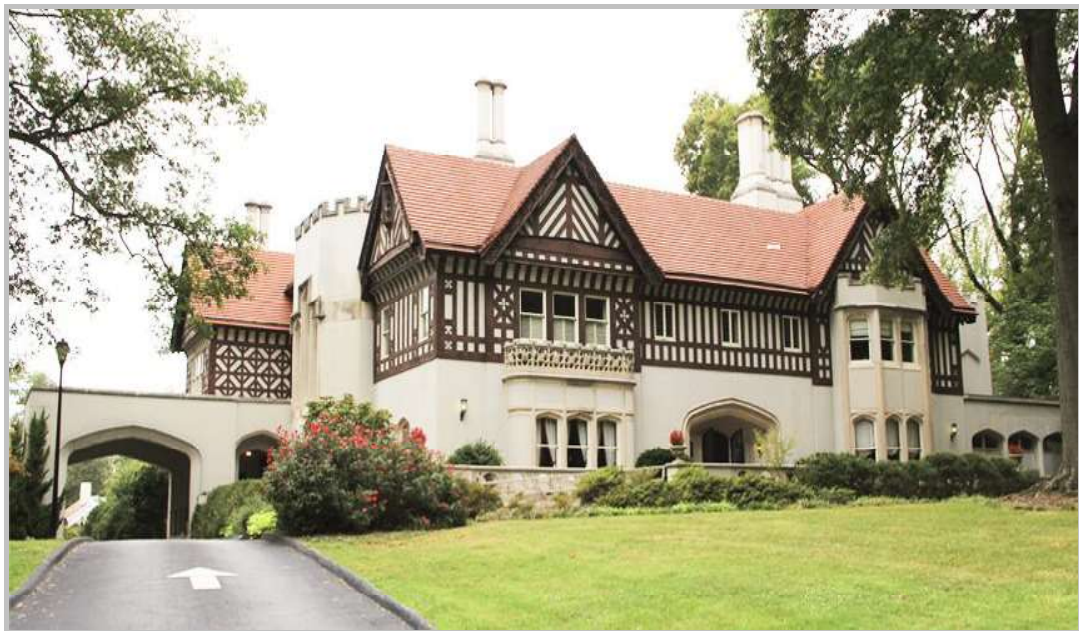
Callanwolde Fine Arts Center