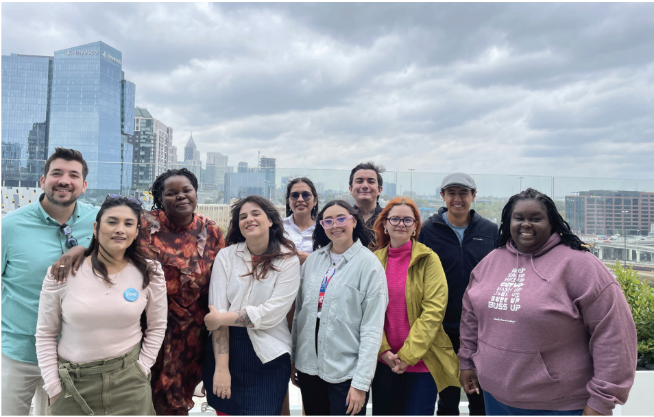
2024 IVLP Visitors by Professional Focus