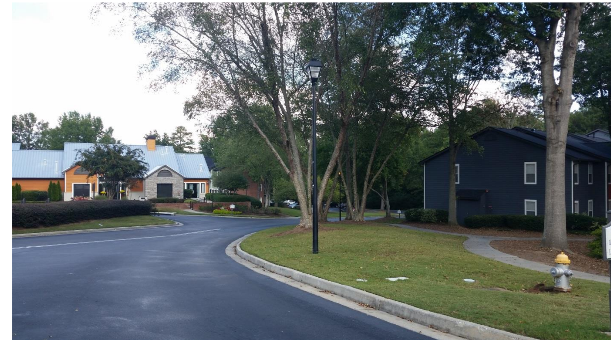
Subject Property – View from N. Druid Hills Road