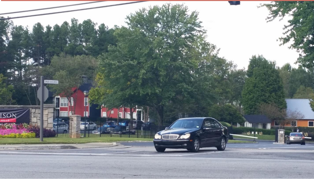
Subject Property at Front Entrance Gate