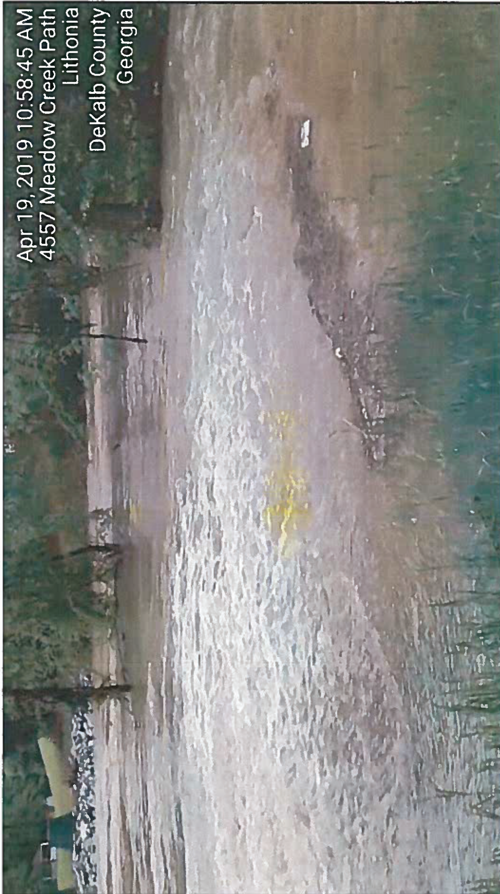
Apr 19, 2019 10:58:45 AM 4557 Meadow Creek Path Lithonia DeKalb County Georgia