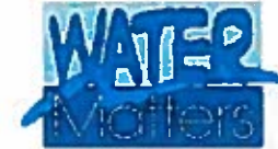
EXHIBIT B PETITION ASSESSMENT FORM