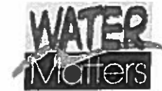
EXHIBIT B PETITION ASSESSMENT FORM