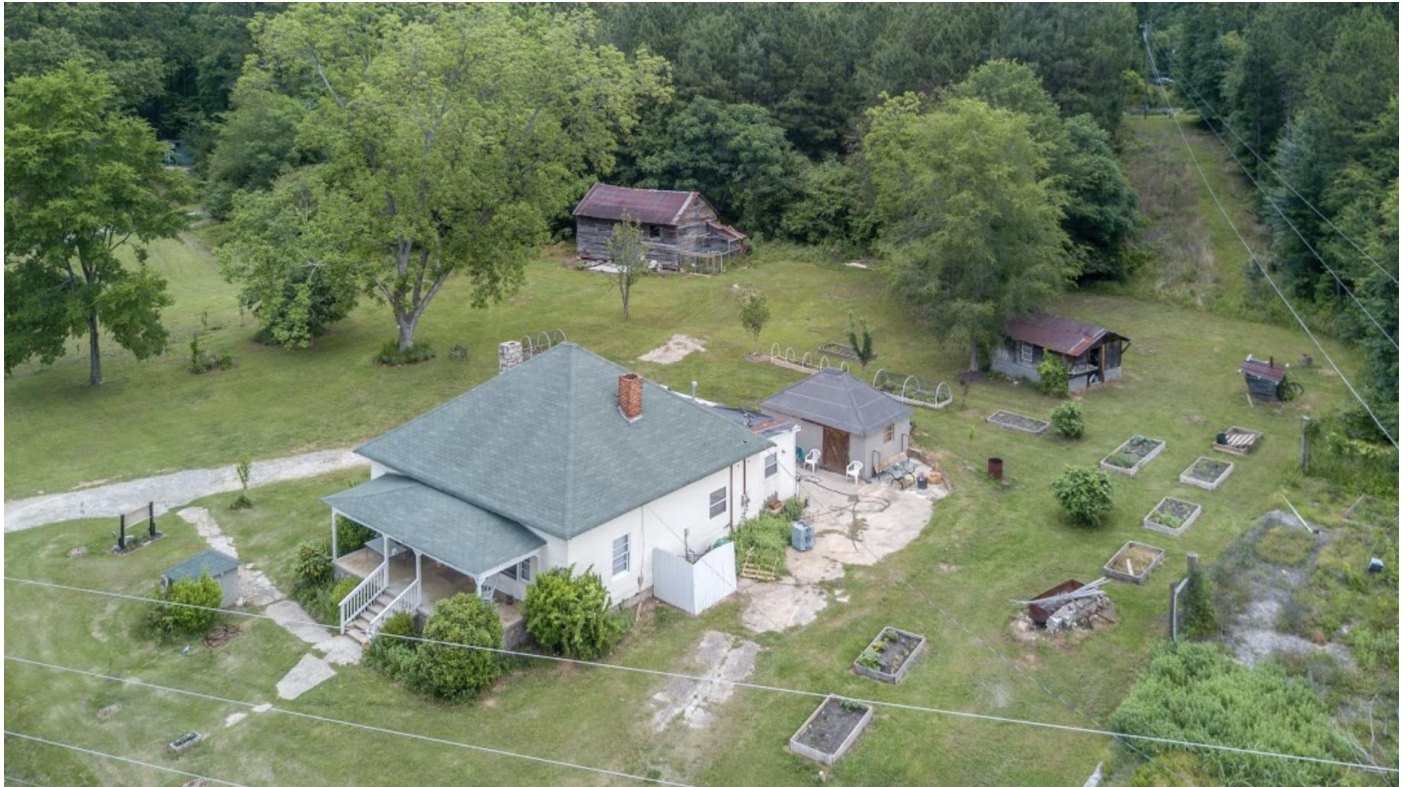
Photo of property