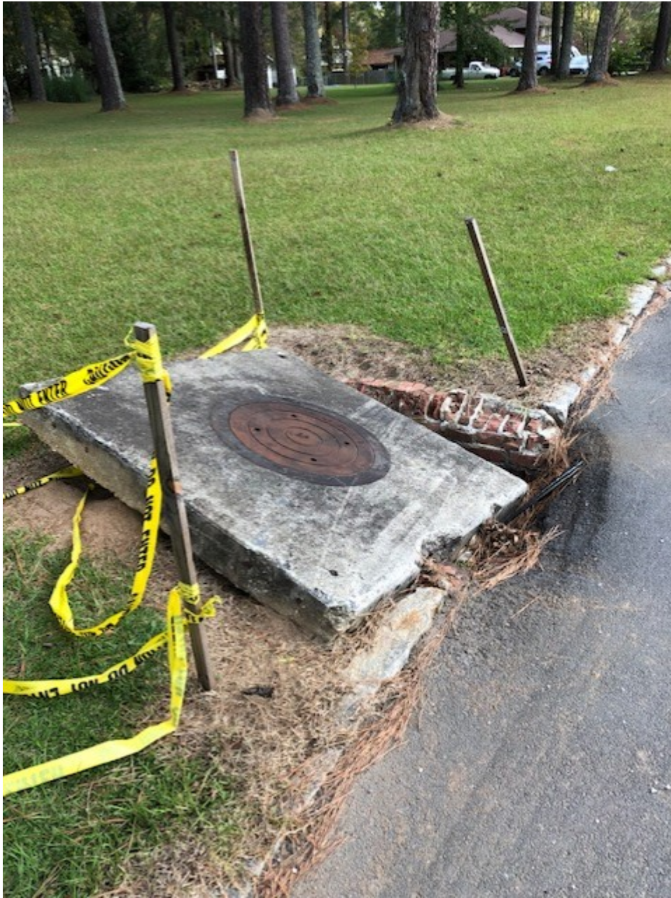
This culvert on Cedar Grove at the end on East Conley was run over by a truck. It has been repaired multiple times but has been in this condition for a few months now.