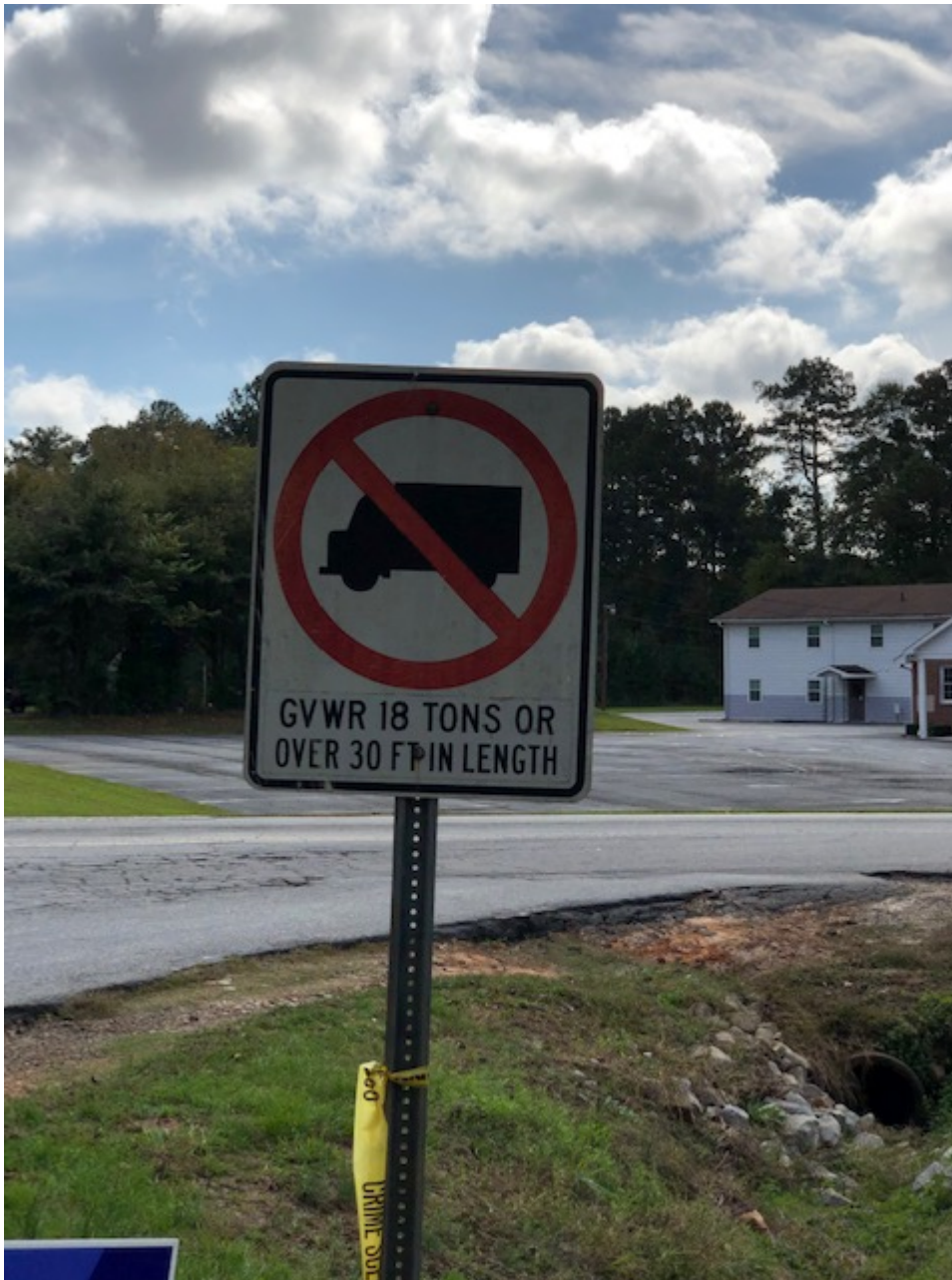
John had asked if there were signs posted. This is at the corner of Cedar Grove & East Conley. The same sign is at both ends of Moore Rd and on Cedar Grove at the 675 overpass traveling toward East Conley.