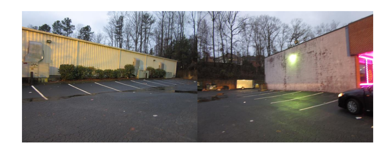
Existing commercial building in the rear of property developed as a shopping plaza