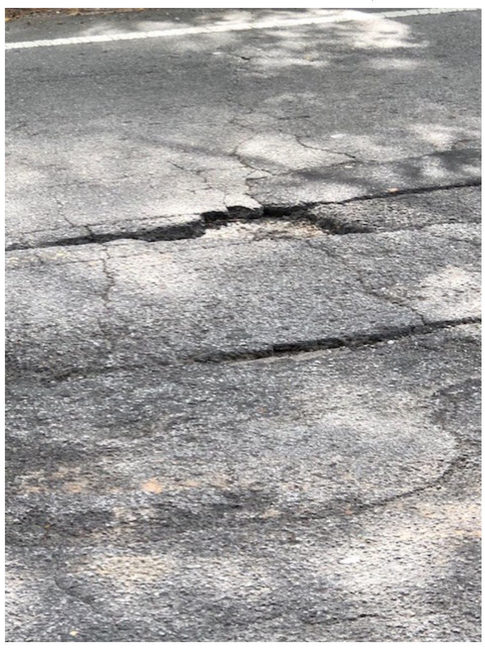
There are many more on this road but I think you get the idea.