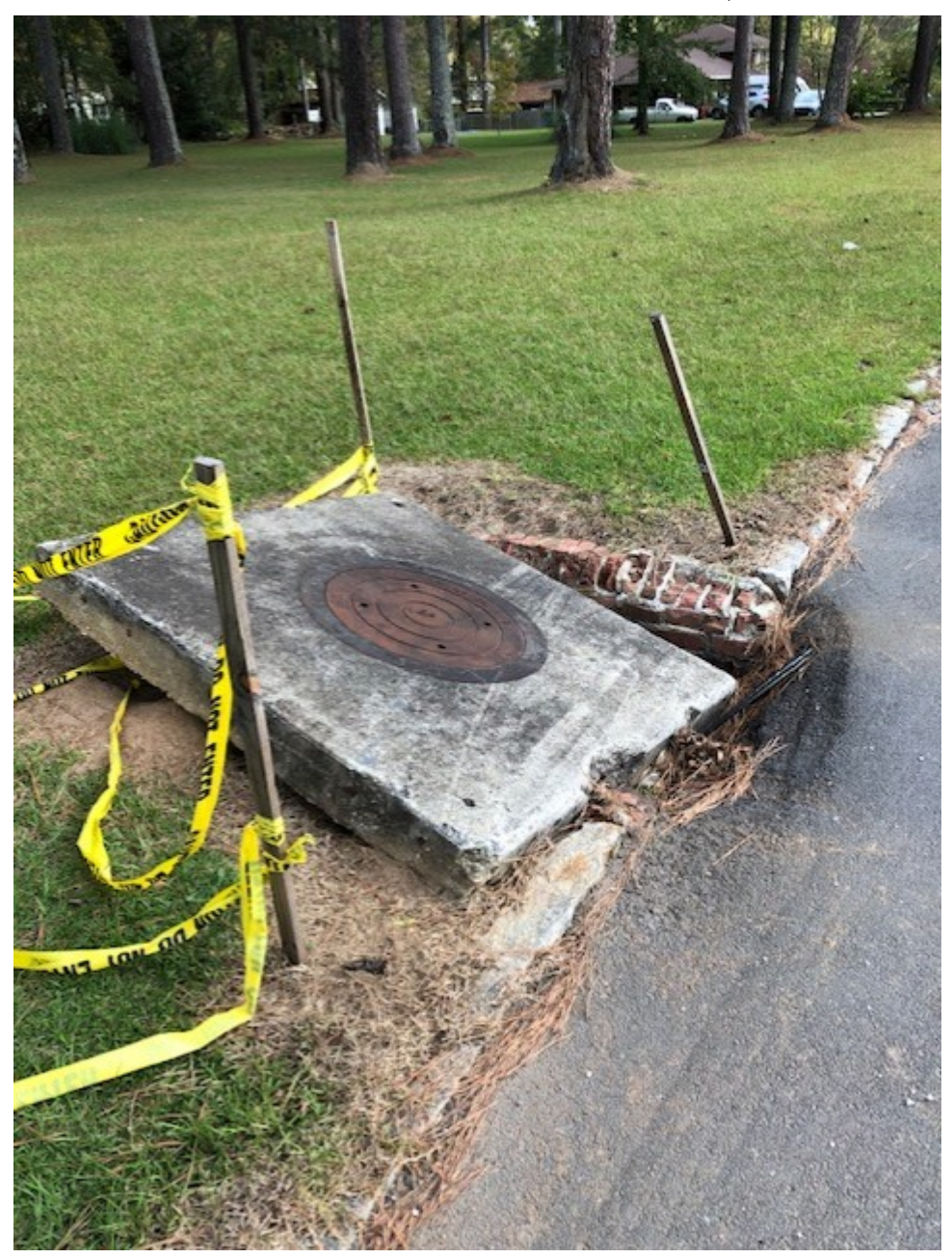
This culvert on Cedar Grove at the end on East Conley was run over by a truck. It has been repaired multiple times but has been in this condition for a few months now.